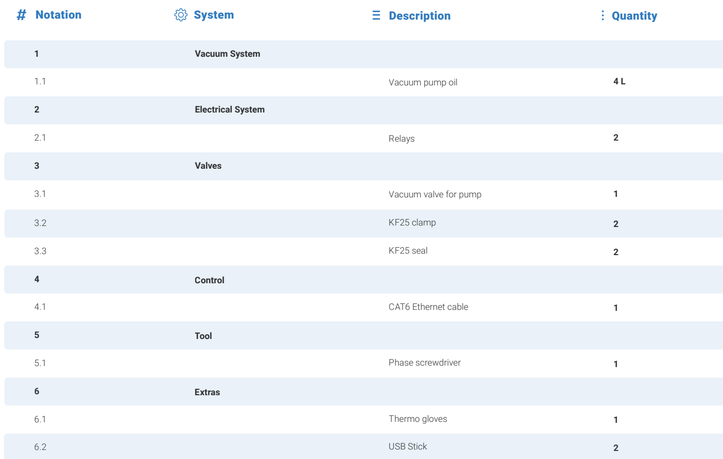
Table 4: Loose Parts List